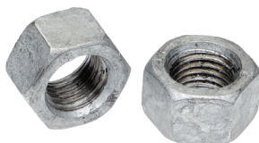
HOT DIP GALVANIZED