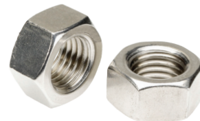
STAINLESS STEEL TYPE 18-8